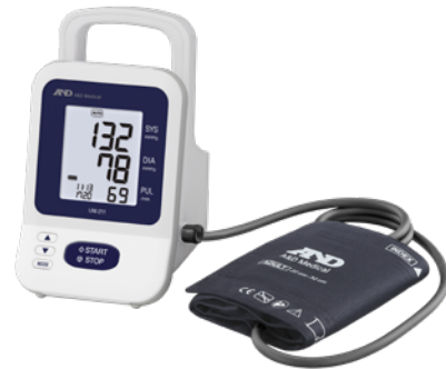
Easy to carry