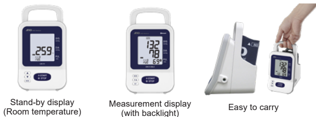
Stand-by display (Room temperature)

Auscultatory mode is designed for daily and frequent use. Selectable deflation speed (2.5 or 5.0 mmHg / sec) and quick start for auscultatory mode features are 'Only from A&D'.